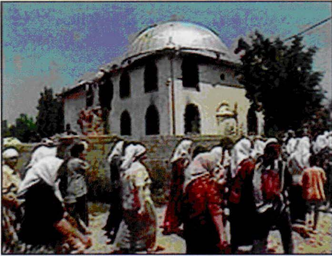
(7/99) burial procession for massacre victims passes mosque